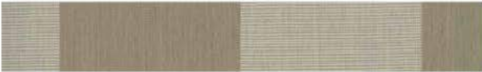
2681 INTEGRAL X UV Protection 60 NEW