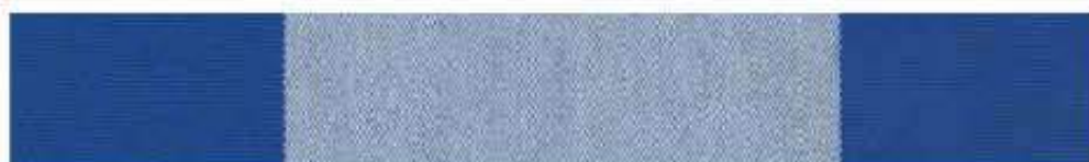
2360 AZUL REAL X UV Protection 80