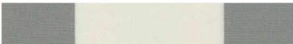
2103 GRIS N UV Protection 60