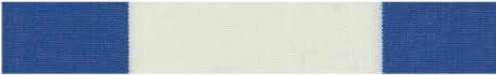
2359 AZUL REAL N UV Protection 60