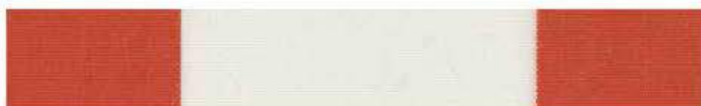
2212 ROJO N UV Protection 40