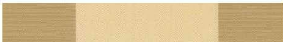
2275 BEIGE X UV Protection 60