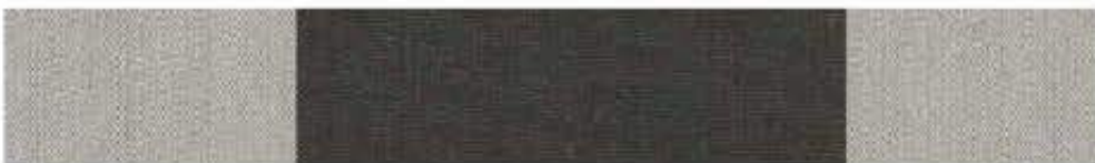
2148 MARRON BEIGE UV Protection 80