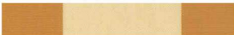
2641 OCRE X UV Protection 60