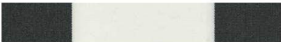
2171 NEGRO N UV Protection 60