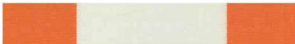
2052 NARANJA N UV Protection 60