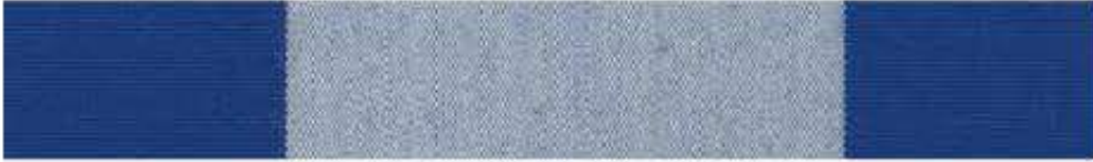
2020 AZUL X UV Protection 80