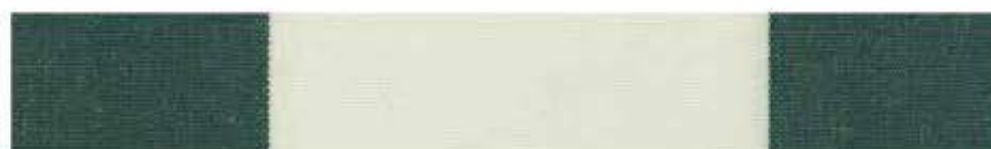
2680 BOTELLA N UV Protection 60