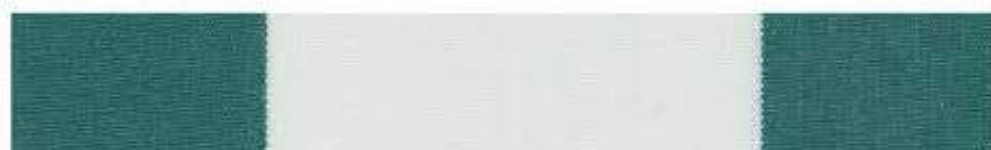
2248 VERDE N UV Protection 60