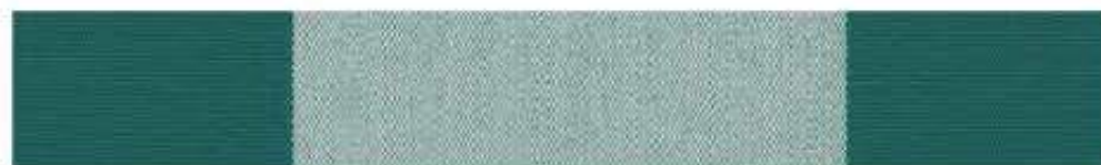
2249 VERDEX UV Protection 80