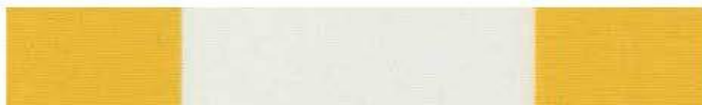
2015 AMARILLO N UV Protection 40