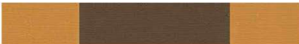
2183 OCRE MARRON UV Protection 80