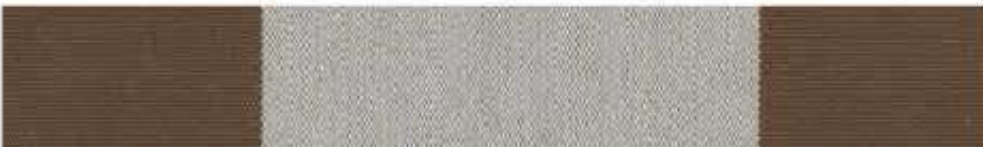
2165 MARRON X UV Protection 80