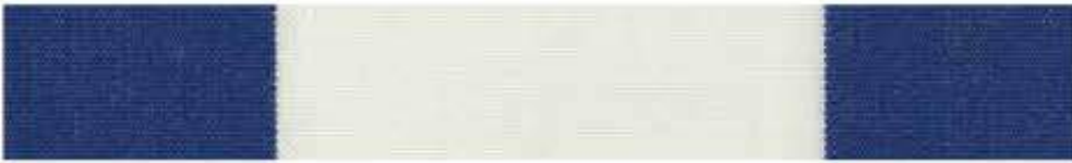
2019 AZUL N UV Protection 60