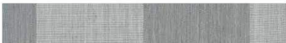
2682 PIEDRA X UV Protection 60 NEW