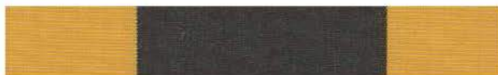
2120 KENIA UV Protection 80