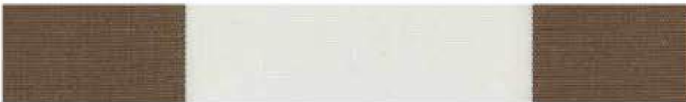
2149 MARRON N UV Protection 60